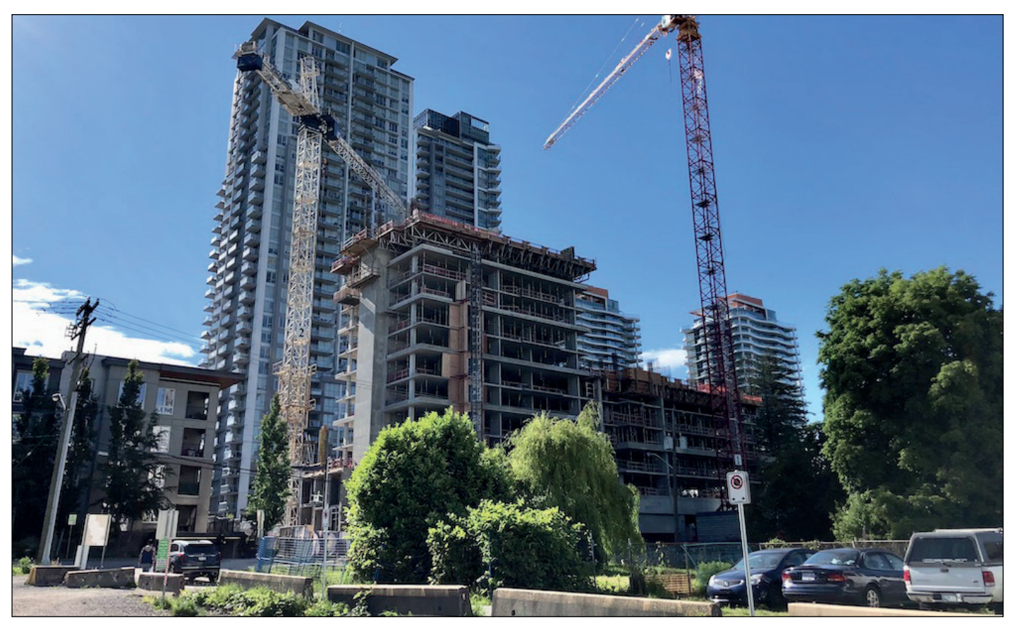
One Central rising in West Village