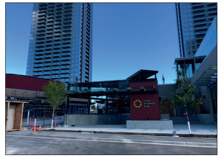
King George Hub retail plaza nearing completion