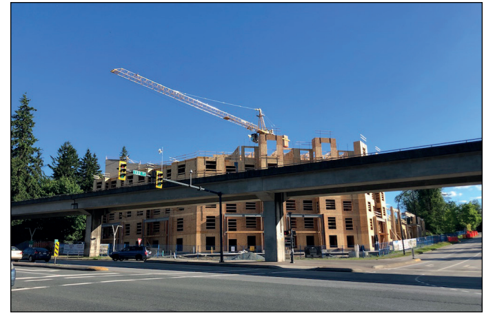
Ledgeview (formerly La Voda) rising at 132 St & King George Blvd