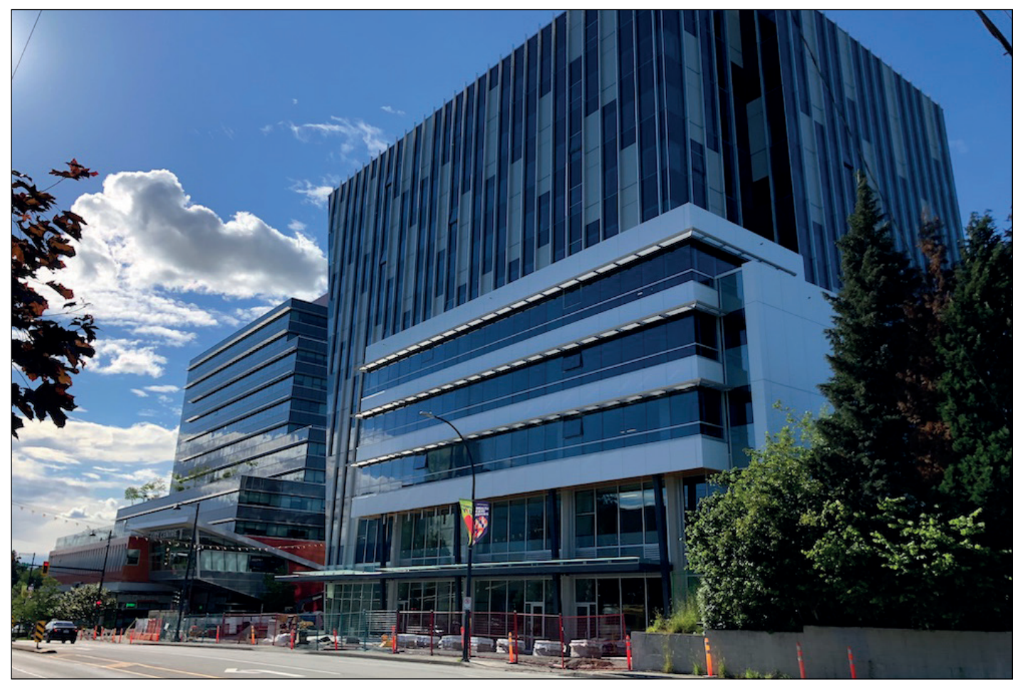
City Centre 3 nearing completion on 96 Ave across from Surrey Memorial Hospital