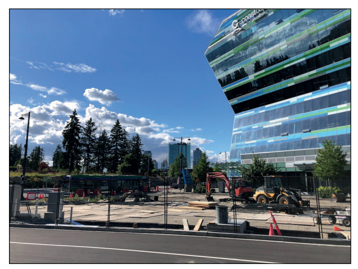
Work begining on 2-storey standalone restaurant at King George Hub