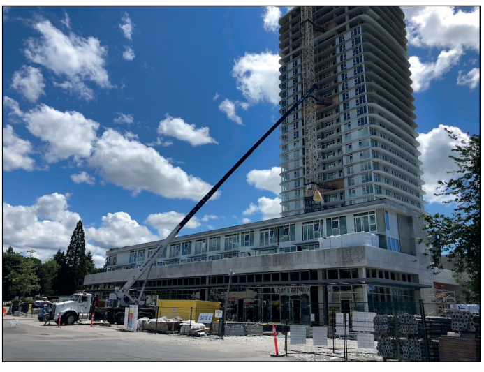
Glazing installation underway on Georgetown retail / townhouse podium