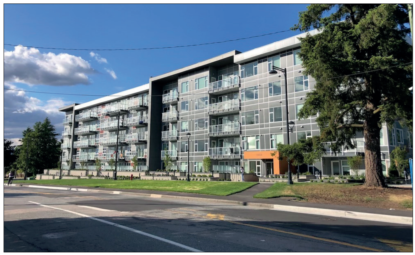
Maverick at Whalley Blvd & Grosvenor Rd completed in May