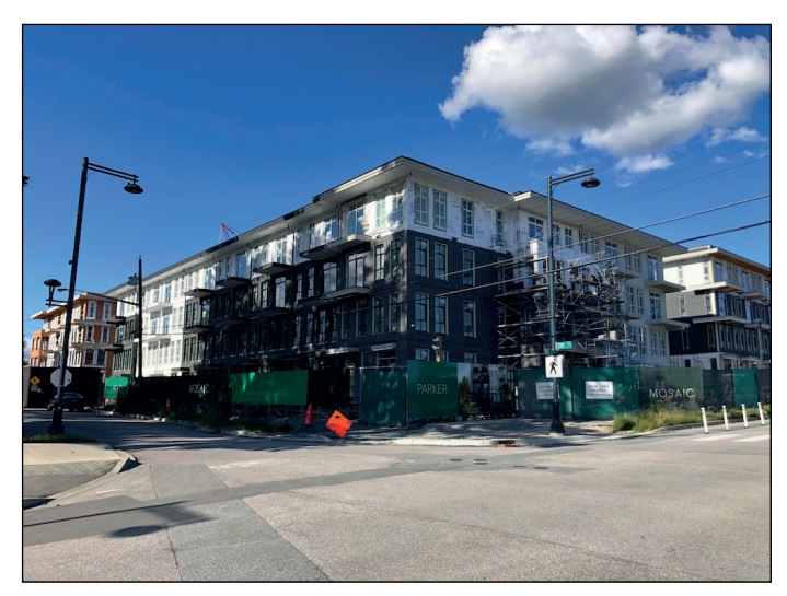
Exterior progress on Parker at 105 Ave & 139 St